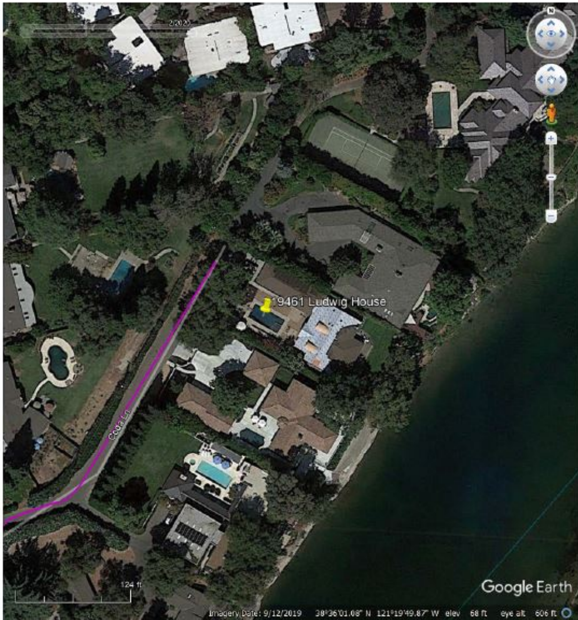
3) Project Footprint map